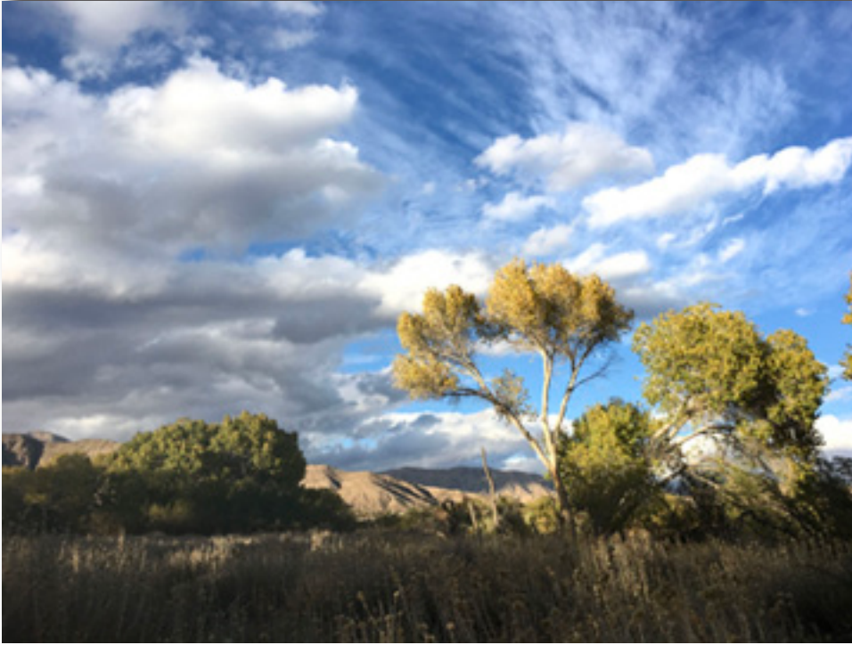
Big Morongo Preserve, Morongo Valley

W e are all missing our fellow members, whether at Chapter and Group meetings, events or Outings. To insure safety for everyone, from volunteers to staff, Sierra Club has continued to hold on all outings and in-person events through Feb 28, 2021. All Chapter and National offices are closed and all staff is working remotely.