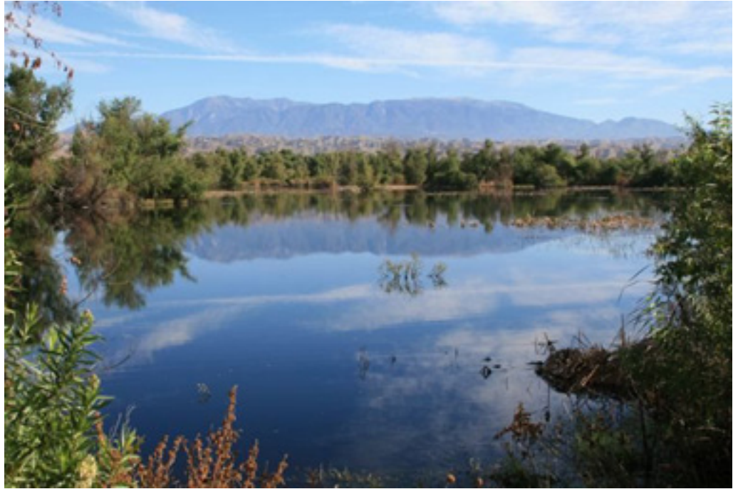
San Jacinto Wildlife Area

Donations Needed: Your donations are essential to our litigation against the World Logistics Center as well as providing professional input into Moreno Valley’s general