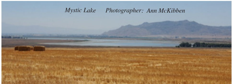
Mystic Lake

The city's general plan update (GPU), MoVal 2040, is being fast-tracked for approval by the spring of 2021, and will very likely dramatically change the current policies and land uses