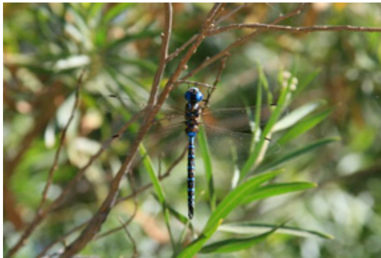
San Jacinto Wildlife Area

Moreno Valley Trade Center: The warehouse project site is located south of Eucalyptus Avenue, west of Redlands Boulevard, and north of Encelia Avenue (includes Hall Nursery and is south of the Aldi warehouse). This project for a light industrial warehouse with 1,332,380 square feet and many diesel truck trips has begun the preparation of a Draft Environmental Impact Report (DEIR) which is likely