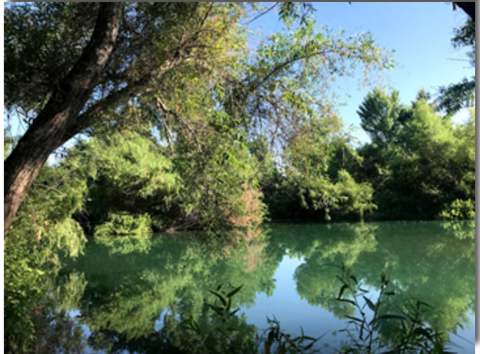
Chino Creek Wetlands, 1.7 miles of hiking trails in Chino